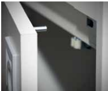
Safety features include automatically shutting off the shredder when the door is open.

Proficiency best describes Dahle's line of Small Office Shredders with their ability to get the job done quickly and easily with minimal effort. Small offices or teams of employees will benefit from the ease of use and quiet operation of these small to mid-size shredders. They're designed to shred between 100 and 400 sheets of paper per day and are perfect for destroying personnel records, client proposals and tax information.