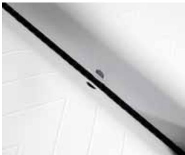
9 1/2" feed opening easily accommodates letter and legal size paper.