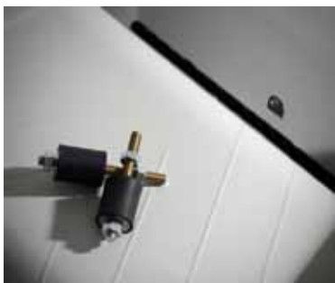
Rubber shock mounts reduce vibration and provide extremely quiet operation.

Dahle Office Shredders use the latest technology. Some models feature full electronic capabilities including such safety features as Automatic Shutoff when the cabinet door opens and Auto Reverse to prevent an overfeed. Automatic On/Off and Bag Full Auto Off are features that offer both convenience and satisfaction in knowing you will be notified when it's time to empty the box or change the bag.