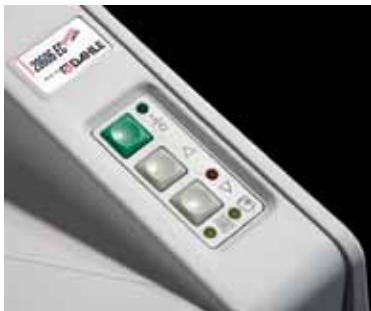
The electronic control panel allows for auto on/off, continuous run, and reverse operation

With the widespread use of networked printers and fax machines, confidential business information is constantly being printed throughout the workday. It's important to have a powerful shredder located nearby to easily dispose of this information. Dahle Office Shredders are designed to accommodate the needs of most busy offices by shredding between 400 and 2,000 sheets of paper per day. This is the perfect device for properly destroying marketing plans, health records, and any other confidential information that should not be seen by others.