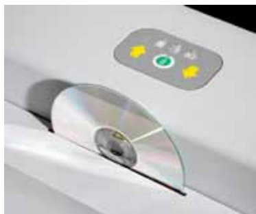
Will shred confidential information on multiple media formats such as Paper, CDs & DVDs.